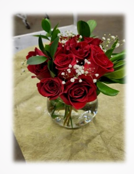
Rose dozen 5159