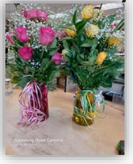
*Designer Rose 9346