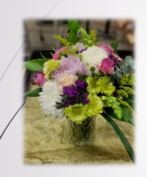
*Best of season 10300 *Consumer bunch 5156