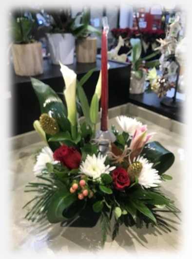
*Best of season large 10302