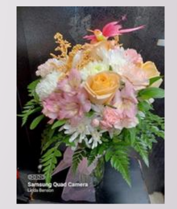
Peaches & Cream item 9661