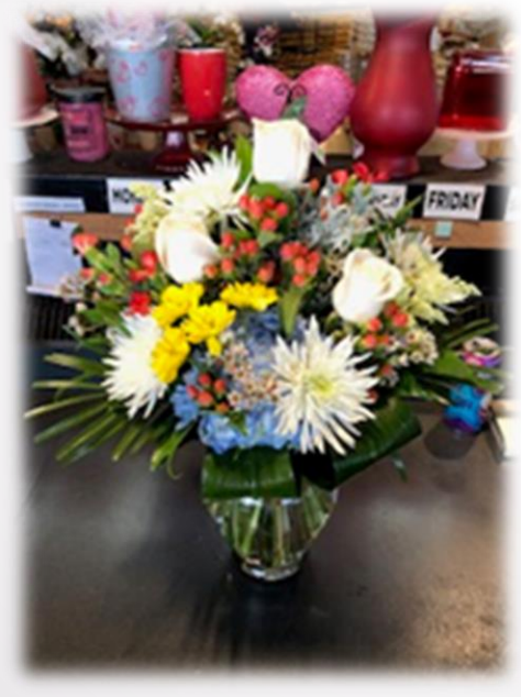
10537 Farmhouse Chic Mixed Bqt