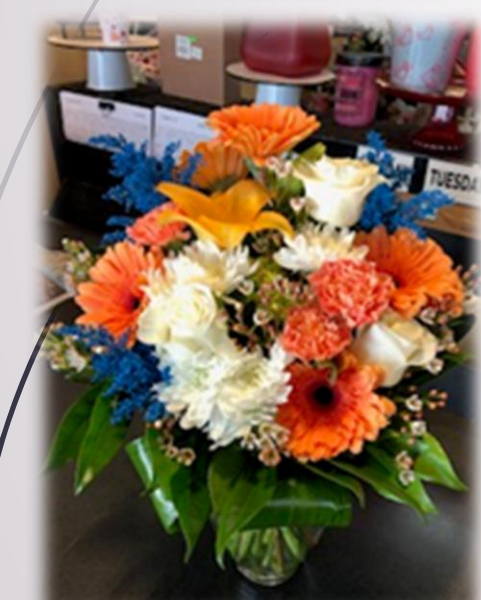
10567 Earth Tones Mixed Bqt