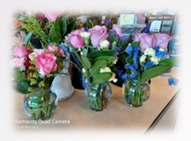
*Blueberry bat 8494 *Greens mix 10561