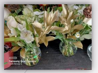
*Rose bat 5159 *Consumer bunch 5156