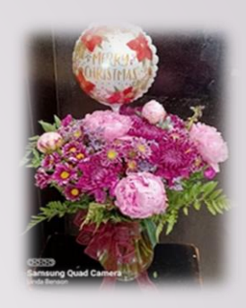
*Best of season 10302 *Rose 5159