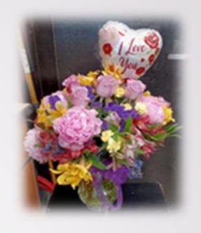
*Best of season 10302 *Rose 5159