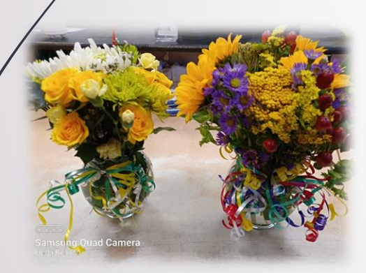
*Best of season 10301