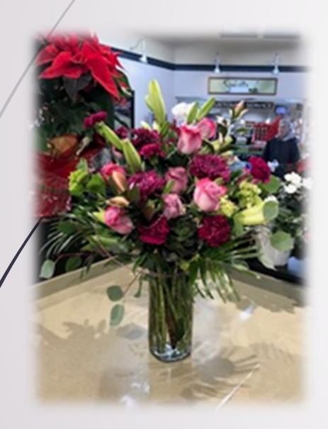
*Best of season large 10302 *Greens Mix 10561 *9 3/4 vase 5606 *Rose 5159