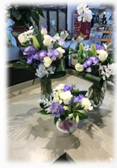
*Peri Fun bunch 10532 *Peri Delight 10533