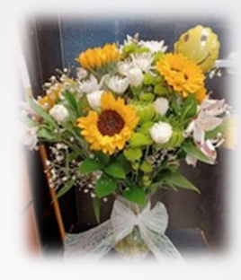
*Best of season 10302