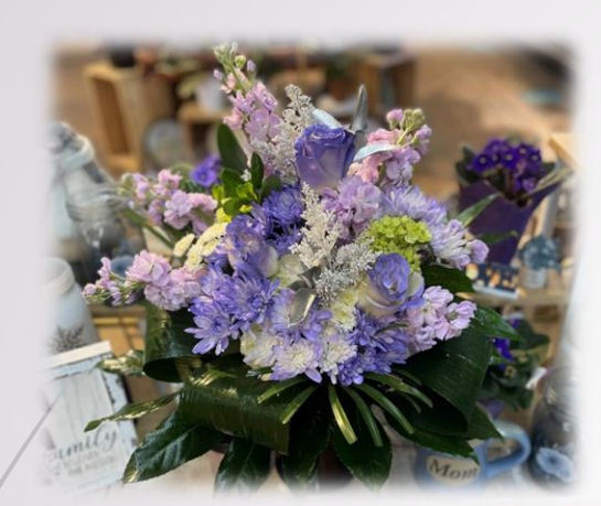
*Peri Fun bunch 10532 *Peri Delight 10533