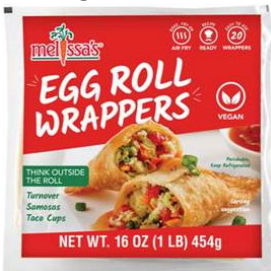
Egg Roll Wrappers