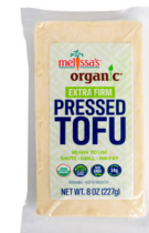
Organic Extra Firm Pressed Tofu