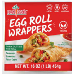
Egg Roll Wrappers