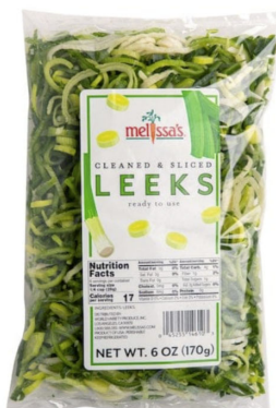
Clean & Sliced Leeks