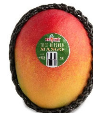
Tree-ripened Kent Mangos