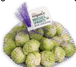
Organic Brussels Sprouts