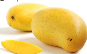
Organic Ataulfo Mangos