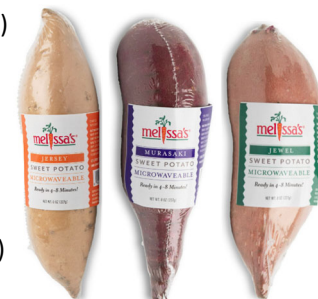
Sweet Potatoes (Microwaveable)