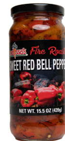
Roasted Red Bell Peppers