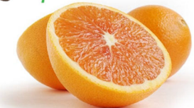
Organic Cara Cara Oranges