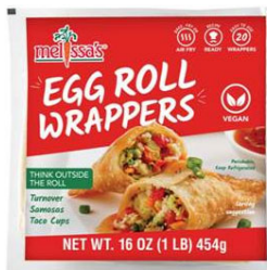
Egg Roll Wrappers