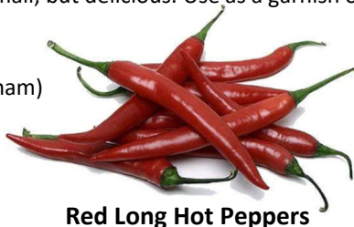
Red Long Hot Peppers