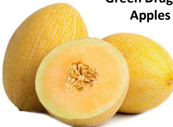
Golden Hami Melons