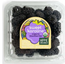
Organic Sweet Karoline® Blackberries