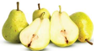
Organic Bartlett Pears