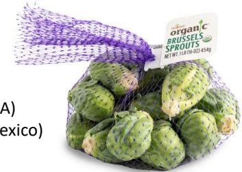
Organic Brussels Sprouts