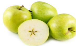
Green Dragon® Apples