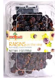
Raisins on the Vine