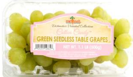
Cotton Candy® Grapes