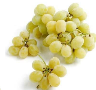
Cotton Candy® Grapes