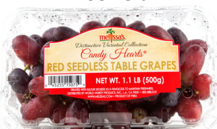
Candy Hearts® Grapes