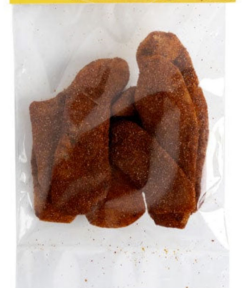
Dried Chile Mango