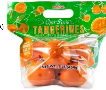
Ojai Pixie Tangerines