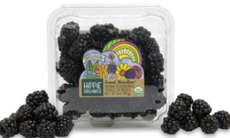
Organic Sweet Karoline Blackberries