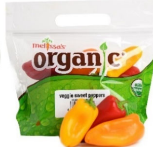
Organic Veggie Sweet Peppers