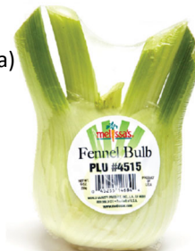
Anise/ Fennel Bulb