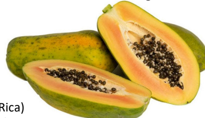
Tai Nung Papayas