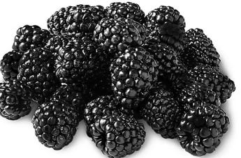
Organic Sweet Karoline Blackberries