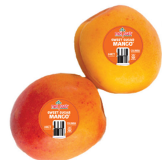
Sweet Sugar Mangos®