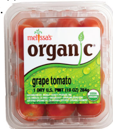
Organic Grape Tomatoes