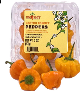
Scotch Bonnet Peppers