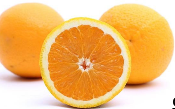
Organic Valencia Oranges