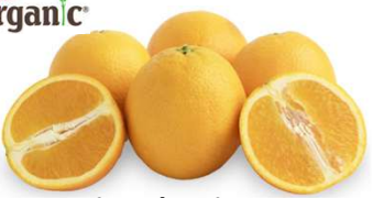
Organic Valencia Oranges