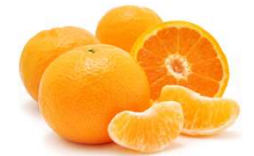
Ojai Pixie Tangerines