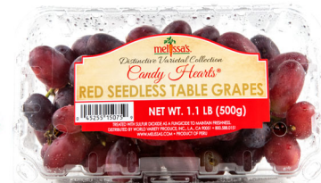
Candy Heart® Grapes