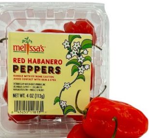
Red Habanero Peppers