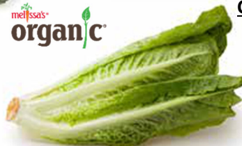
Organic Romaine Lettuce