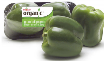
Organic Green Bell Peppers