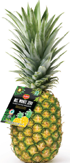
Zero Gold Pineapples