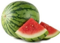
Organic Mini Red