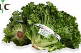
Organic Green Leaf Lettuce