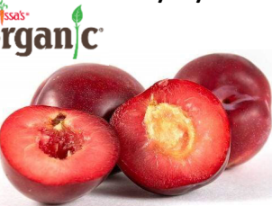
Organic Plum Bites