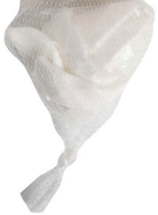
Organic Coconut Slices