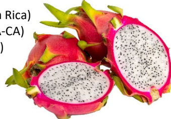
White Dragon Fruit