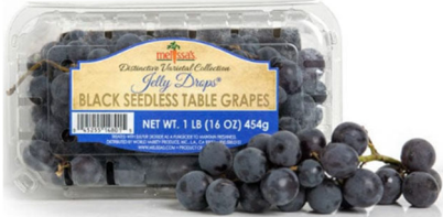
Jelly Drops® Grapes