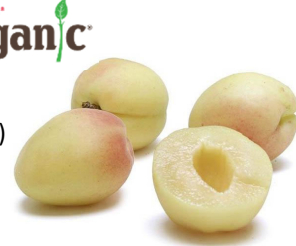
Organic White Apricots