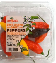
Bhut Jolokia Peppers