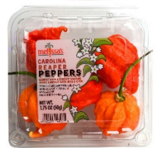
Carolina Reaper Peppers