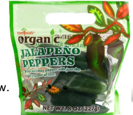
Organic Jalapeno Peppers