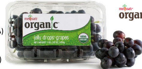
Organic Jelly Drops® Grapes