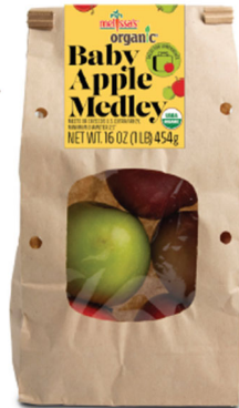
Organic Baby Apple Medley