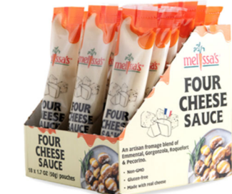
Four Cheese Sauce