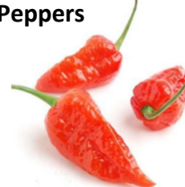
Bhut Jolokia Peppers