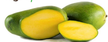
Organic Green Keitt Mangos