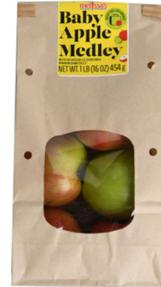
Baby Apple Medley