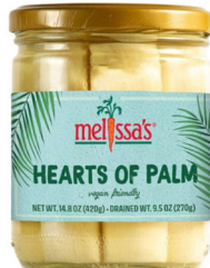
Hearts of Palm