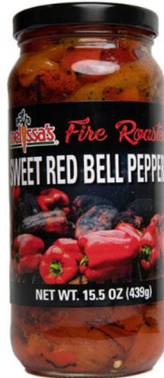
Roasted Red Bell Peppers