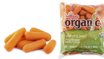
Organic Baby Carrots