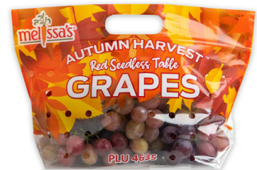
Autumn Harvest™ Grapes