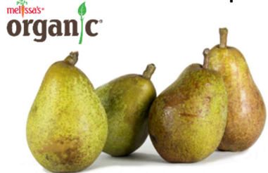
Organic Warren Pears