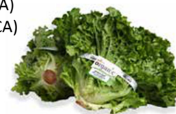
Organic Leaf Lettuce