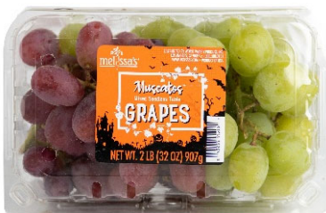
Bi-color Muscato™ Grapes