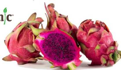
Organic Magenta Dragon Fruit