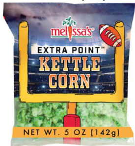
Extra Point™ Kettle Corn