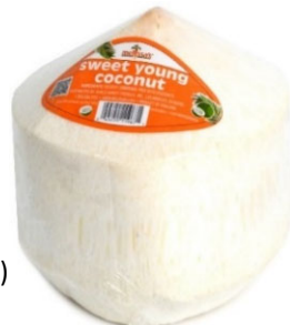
Sweet Young Coconuts