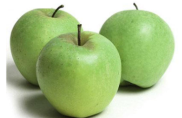
Green Dragon® Apples