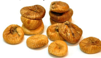
Greek String Figs