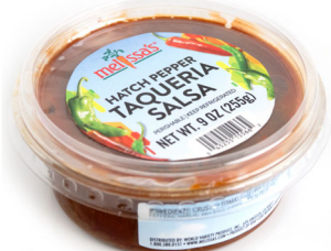
Hatch Pepper Taqueria Salsa