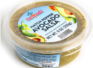
Hatch Pepper Avocado Salsa