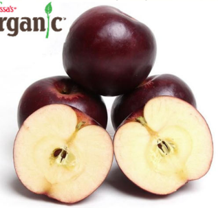
Organic Arkansas Black Apples