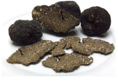
Italian Burgundy truffle