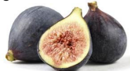
Black Mission Figs