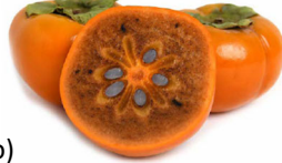
Organic Cinnamon Persimmons