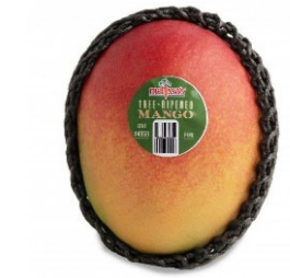
Tree Ripe Kent Mangos