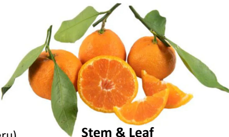
Stem & Leaf Tangerines