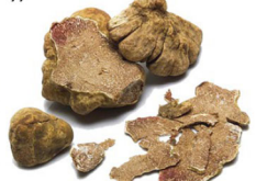
Italian White truffle