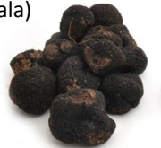
Italian Black Winter Truffle