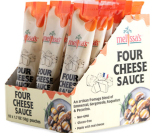
Four Cheese Sauce