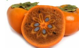
Organic Cinnamon Persimmons