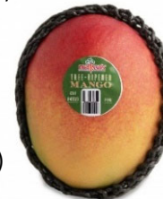
Tree Ripe Kent Mangos