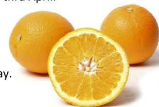
Heirloom Navel Oranges