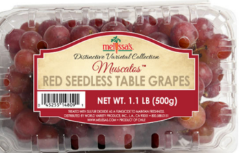
Red Muscato™ Grapes