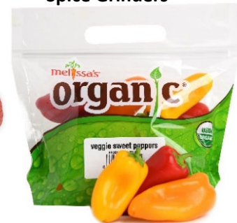
Organic Veggie Sweet Peppers