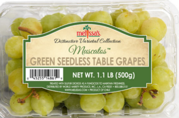
Green Muscato™ Grapes