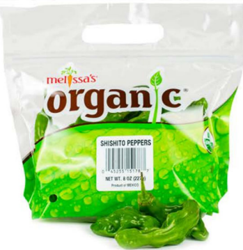
Organic Shishito Peppers