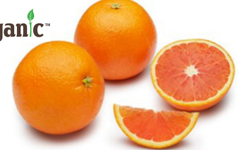
Organic Cara Cara Oranges