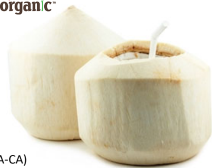
Organic Sweet Young Coconuts