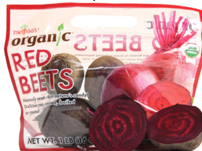
Organic Red Beets