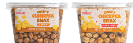
Crispy Chickpea Snax