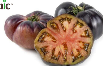
Organic Darkloom Tomatoes