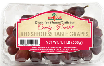
Candy Hearts® Grapes