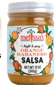
Orange Habanero Salsa