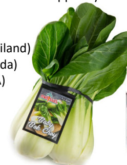
Baby Bok Choy