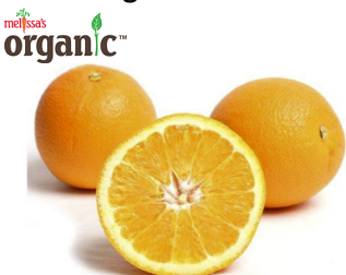
Organic Navel Oranges