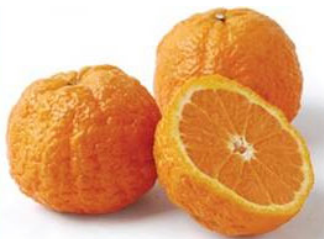
Gold Nugget™ Tangerines