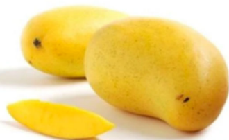
Organic Ataulfo Mangos