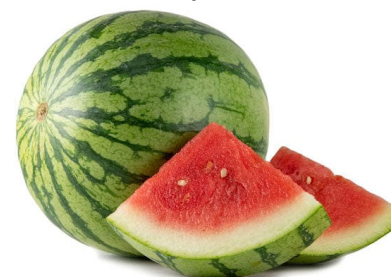
Mini Red Watermelons