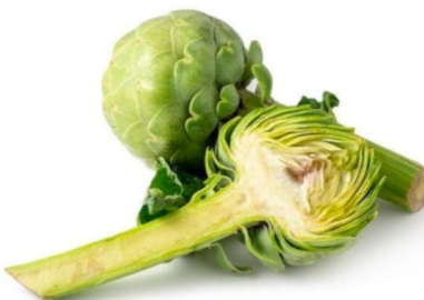
Long Stem Artichokes