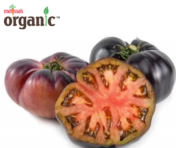
Organic Darkloom Tomatoes