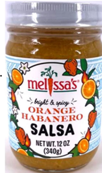
Orange Habanero Salsa