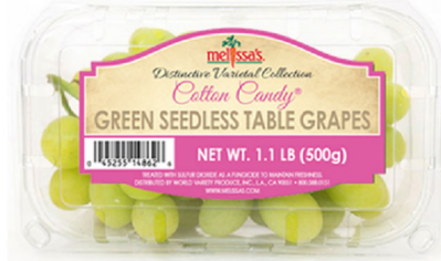
Cotton Candy® Grapes