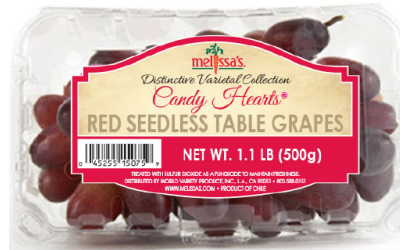
Candy Hearts® Grapes