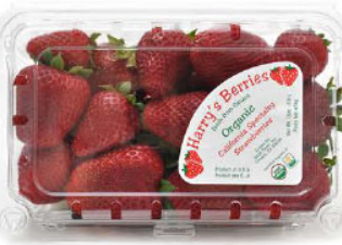
Organic Strawberries "Harry's Berries"