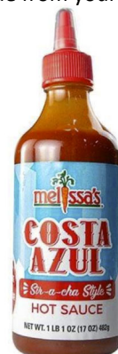
Costa Azul Hot Sauce