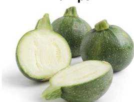
8 Ball Squash