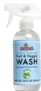
Fruit & Veggie Wash