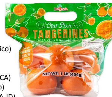
Ojai Pixie Tangerines