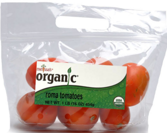
Organic Roma Tomatoes