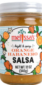
Orange Habanero Salsa