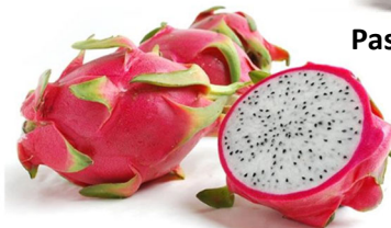
White Dragon Fruit