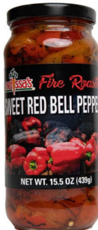
Roasted Red Bell Peppers