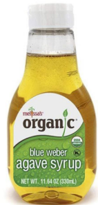
Organic Agave Syrup