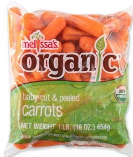
Organic Peeled & Cut Carrots