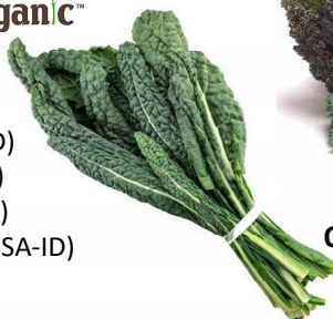
Organic Green Kale