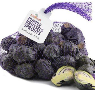
Purple Brussels Sprouts