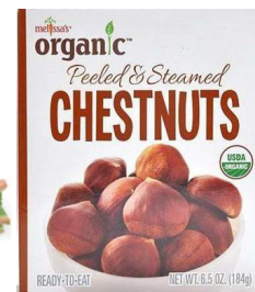
Organic Peeled & Steamed Chestnuts