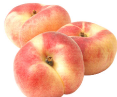
Organic Donut Peaches