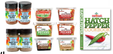
Tropical Clean Snax®