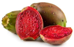
Red Cactus Pears