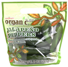
Organic Jalapeno Peppers