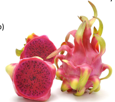
Red Dragon Fruit