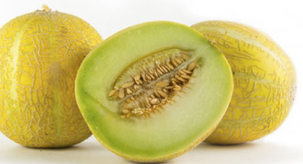
Lemon Drop Melons