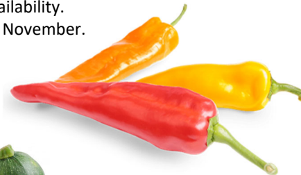
Long Sweet Peppers