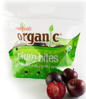
Organic Plum Bites