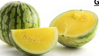
Mini Yellow Watermelons