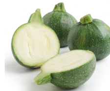
Eight Ball Squash