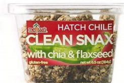
Hatch Clean Snax®