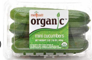
Organic Mini Cucumbers