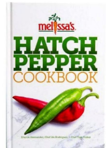
Hatch Pepper Cookbook