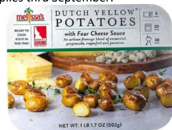
Dutch Yellow® Potatoes w/ Four Cheese Sauce