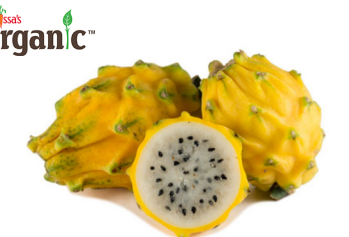
Organic Yellow Dragon Fruit