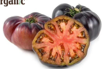
Organic Darkloom Tomatoes