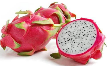
White Dragon Fruit