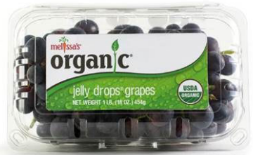
Organic Jelly Drops®