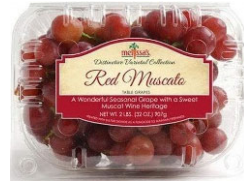
Red & Green Muscato™ Grapes