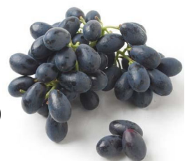
Black Muscato™ Grapes