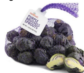
Purple Brussels Sprouts