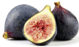
Black Mission Figs