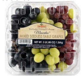
Tri-Color Muscato™ Grapes