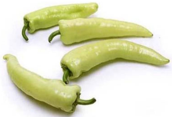
Hungarian/ Banana Wax Peppers