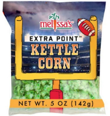
Extra Point™ Kettle Corn