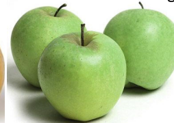
Green Dragon® Apples