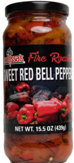
Roasted Red Bell Peppers