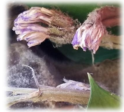
White fuzzy mold