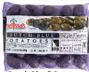
Dutch Blue® Potatoes