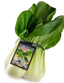
Baby Bok Choy