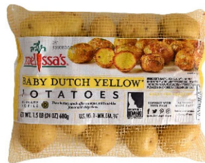
Baby Dutch Yellow® Potatoes