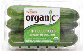
Organic Mini Cucumbers