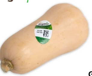
Organic Butternut Squash