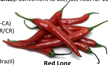
Red Long Hot Peppers