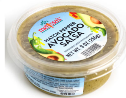
Hatch Pepper Avocado Salsa