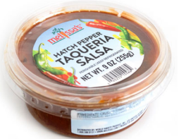
Hatch Pepper Taqueria Salsa