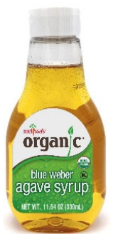
Organic Blue Weber Agave Syrup